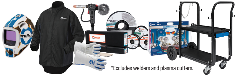
*Excludes welders and plasma cutters.

BUY $500 IN QUALIFYING PRODUCTS GET A $200 REBATE